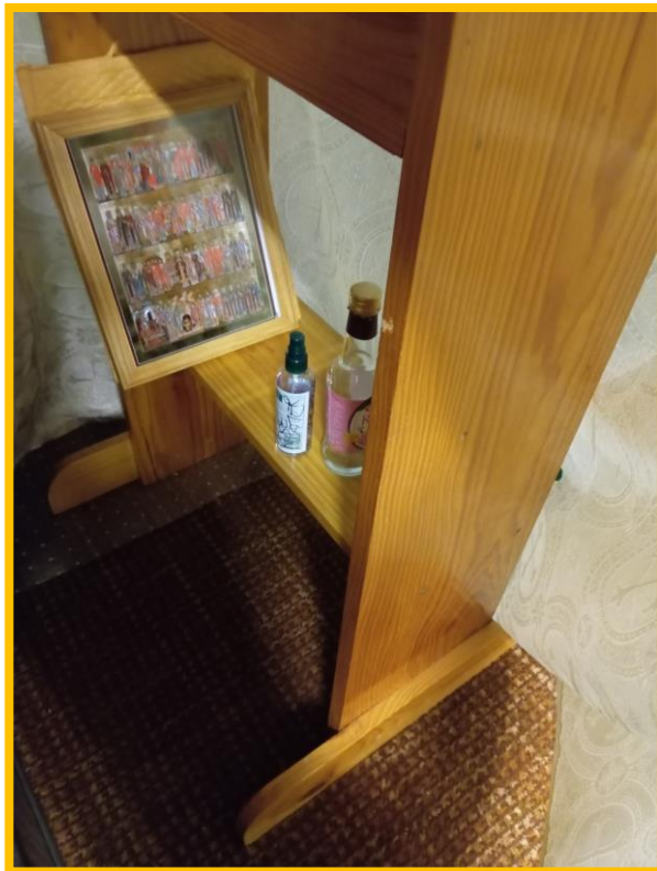
Rose water located on shelf of icon stand (behind cover)

You will find some bottles of Rose Water, on a shelf, behind the Icon Stand. Spray some Rose Water on the icons.