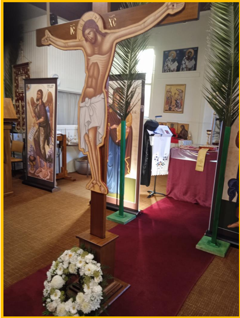
Wreath for Altar Cross on Sunday of Cross Veneration (3 rd Sunday of Lent) and for Holy Thursday