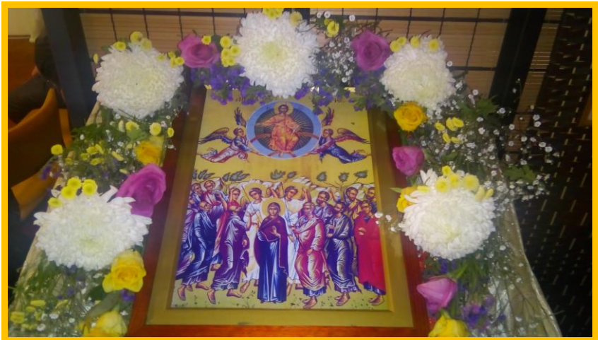
Festal Icon of Ascension framed with flowers and greenery

Icon Stand = Frame the festal icon of Ascension with flowers.