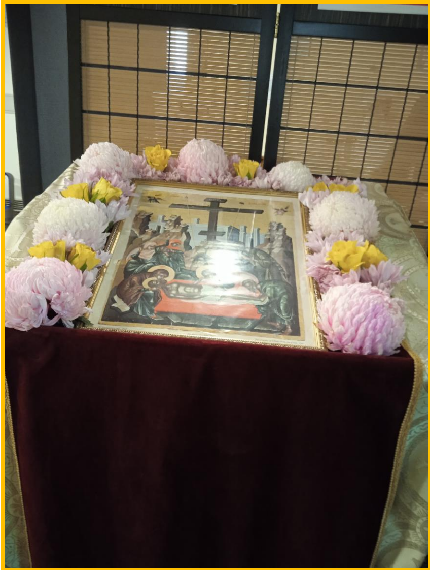
Icon of the Burial of Christ framed with flowers