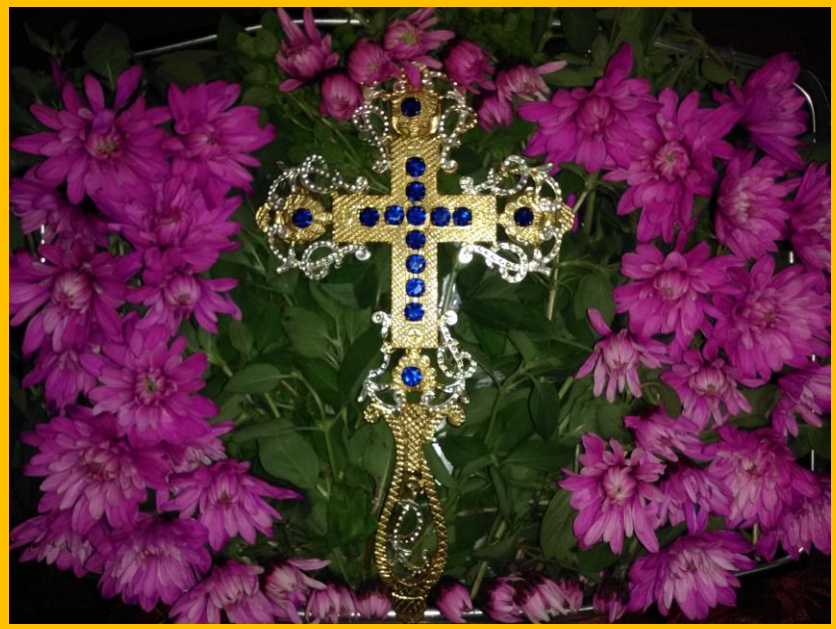
Icon Stand with Cross lying on a bed of Basil and framed with flowers