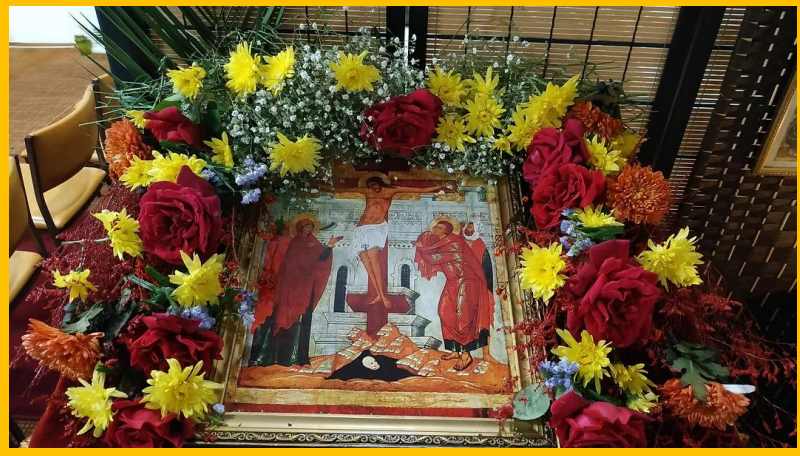
Icon of the Crucifixion on Holy Thursday framed with flowers