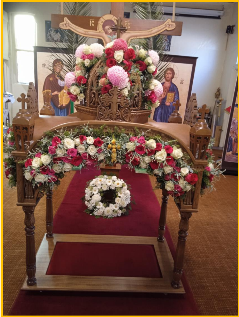
The Epitaphios (Sepulcher/Bier)