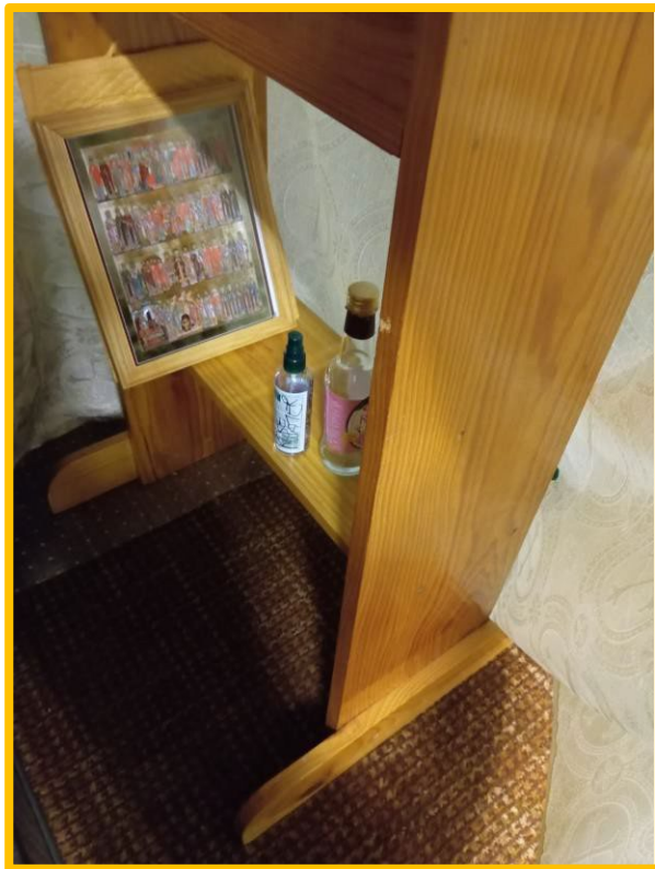
Rose water located on shelf of icon stand (behind cover)

You will find some bottles of Rose Water, on a shelf, behind the Icon Stand. Spray some Rose Water on the icons.