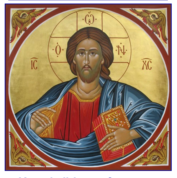
You shall be perfect, even as your Father Who is in the heavens is perfect. Matthew 5: 48

What is the Meaning of Life? To be closer to God by becoming more like him.